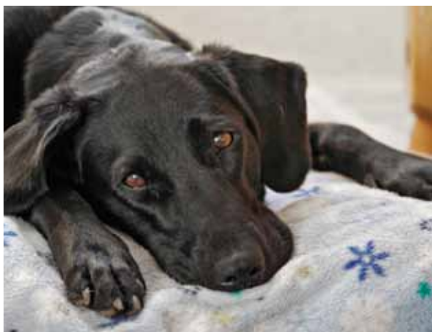
Dixie, a Hurricane Katrina survivor found on the streets of New Orleans, was rehomed when her owners could not be located. Not enough pet owners have a plan for who will care for their animal if disaster strikes.