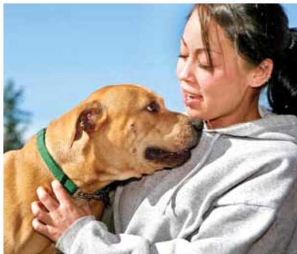
Shelters can help decrease pet relinquishments due to the owner’s death or disability by educating adopters about making plans beforehand.

Many rescue groups say they’ll take back the animals if an adopter dies or becomes incapacitated,